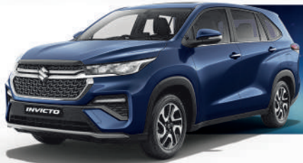
NEXA BLUE (CELESTIAL)